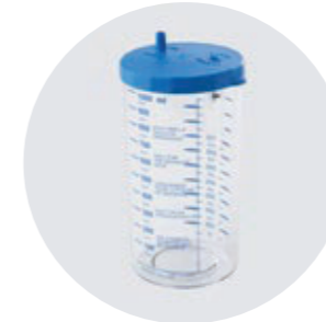
1000cc KAVANOZ 1000cc JAR