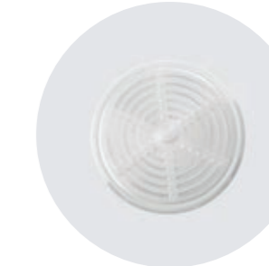
ANTİBAKTERİYEL FİLTRE ANTIBACTERIAL FILTER