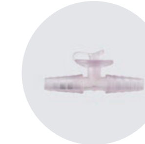
TEK KULLANIMLIK AKIŞ REGÜLATÖRÜ DISPOSABLE FLOW REGULATOR