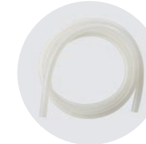
SİLİKON BAĞLANTI HORTUMLARI CONNECTING SILICONE TUBE