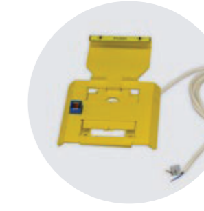
ŞARJ SİSTEMLİ DUVAR BAĞLANTISI WALL BRACKET WITH RECHARGING SYSTEM