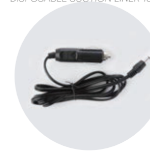
12V GÜÇ KABLOSU FİŞ POWER CORD 12V PLUG