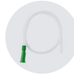
STERİL TEK KULLANIMLIK KANÜL DISPOSABLE STERILE CANNULA