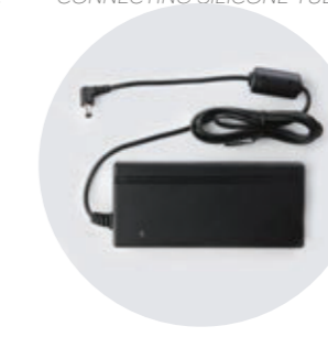
ÇOKLU GERİLİM ŞARJ ÜNİTESİ MULTI-VOLTAGE CHARGER UNIT