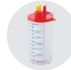
1000cc TEK KULLANIMLIK KAVANOZ TORBASI DISPOSABLE SUCTION LINER 1000cc