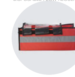
MINIASPEED EVO TAŞIMA ÇANTASI CARRYING CASE MINIASPEED EVO