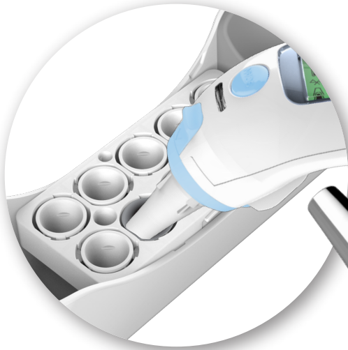
Apply Probe Filter